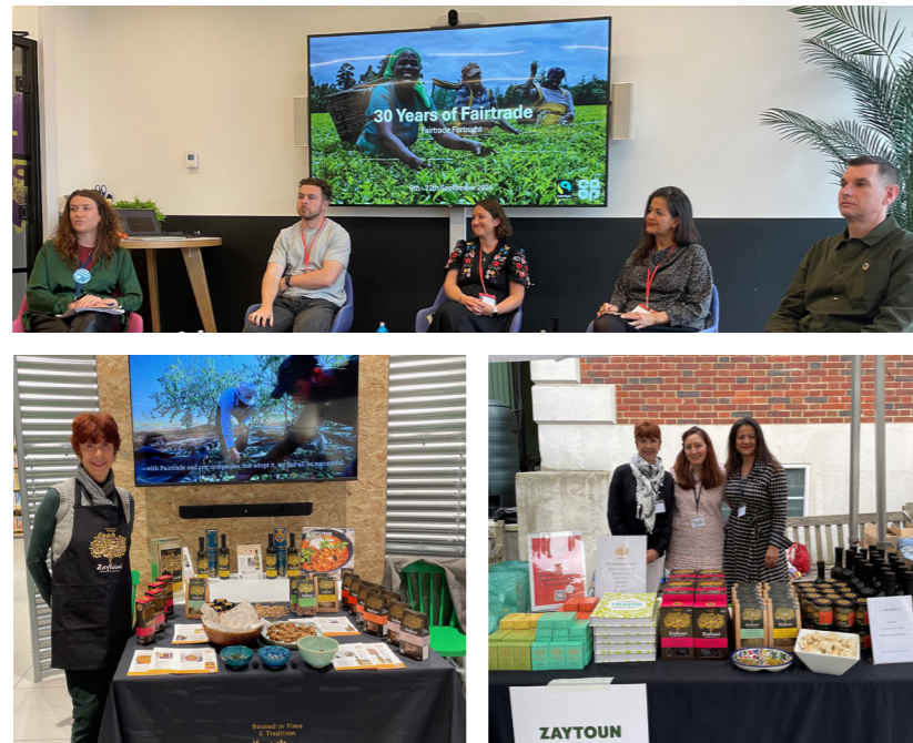
The Zaytoun team at Co-op, Oxfam and fundraising events

Throughout the year we joined events organised by partners and friends across the UK - conferences, supper clubs and fundraisers. In a year as heavy as 2024, these gatherings mattered beyond the usual purpose of such events. They were spaces where people with a shared connection to Palestine could come together - to grieve, to hope, and to find in each other the solace and resolve to keep going.