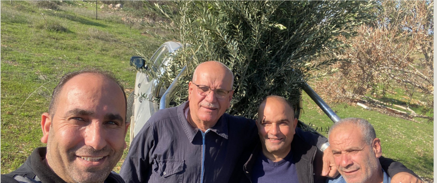
Farmer with PFTA team while trees planting

Olive trees are deeply rooted in the culture and also known as a symbol of Palestine and history of the land. This year Israel on going acts affected Palestinian farmers by preventing them to harvest their crops on their land that are closed to the Wall or in the other side , These acts have not only erased palestine cultural heritage but have also deprived families of their primary source of income.